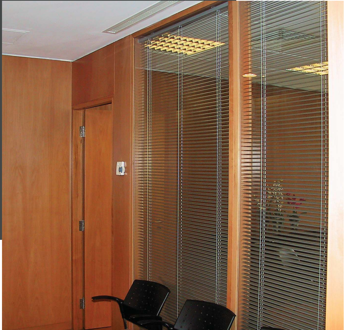
Wooden frames monoline